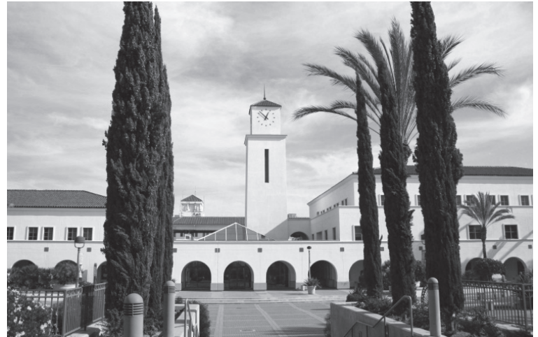
San Diego State University clock tower.